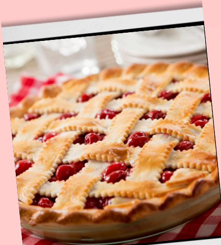
Annual Pie Auction February 15, 2026